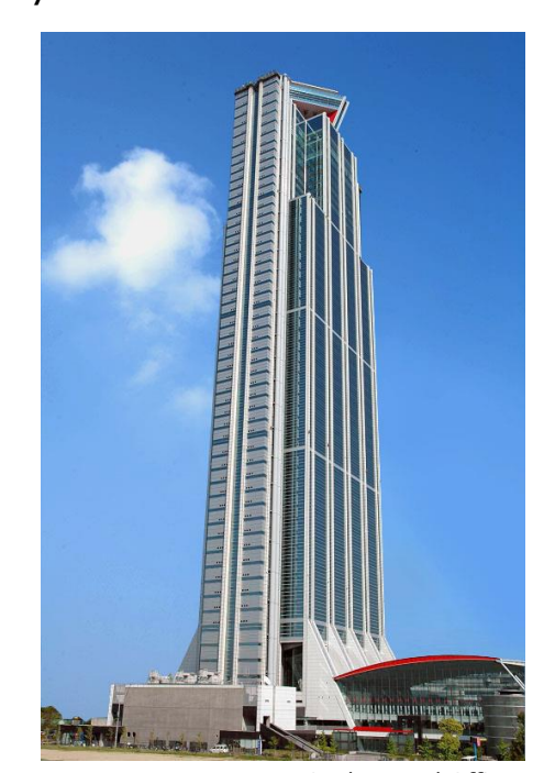
Osaka Head Office

Business: Purchase and sales of damaged vehicles, vehicles recycling online auction